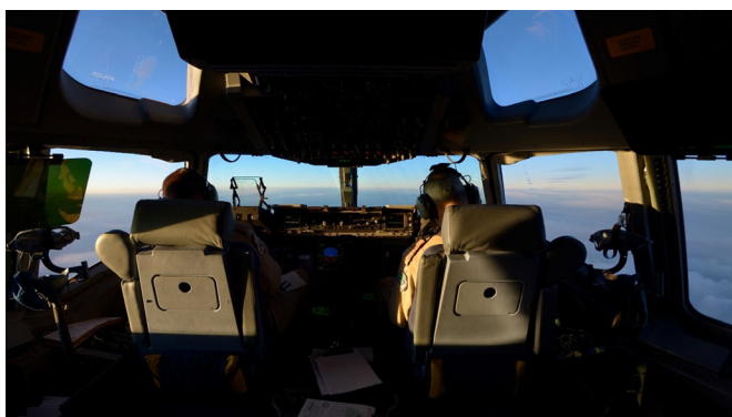
Figure 5 C-17 strategic transport flight deck. Incapacitation of either (category 2) pilot may result in a mission abort but is unlikely to compromise flight safety. (Reproduced with permission from the Royal Canadian Air Force)

Can he be returned to flying duties? Further assessment of his fitness to fly requires a clearer definition of his risk for a cardiac event. He clearly has coronary atherosclerosis and requires usual primary prevention (as per national clinical guidelines) but he has no evidence of inducible ischaemia. For major adverse cardiovascular events, data from follow-up of coronary calcium score indicate a 1%/year for individuals with a coronary artery