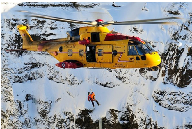
Figure 4 Search and rescue helicopter mountain hoist operation. Sudden incapacitation of either (category 1) pilot is likely to result in disaster.

such as tanker, transport or bomber aircraft). To reflect these differing aircrew roles for risk matrices, the RCAF also defines four categories of aircrew for the purposes of assessing aeromedical risk, as shown in table 2 . 7